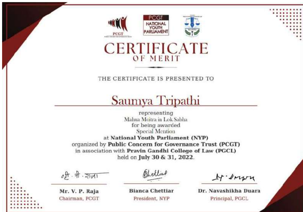
PCGT NYP-22 (Special Mention), Saumya Tripathi