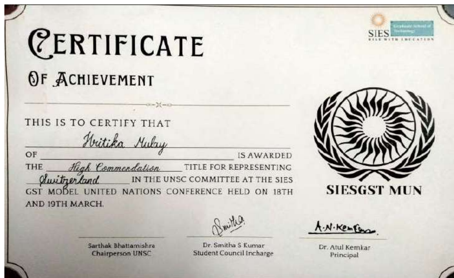
High Commendation title for representing Switzerland, Hritika Mulay